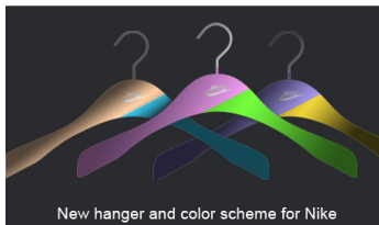
New hanger and color scheme for Nike

With unrivalled fashion hanger design and sense of trends, we can work up with the customers to develop and produce the must-have hangers in time.