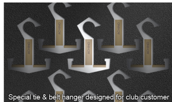
Special tie & belt hanger designed for club customer