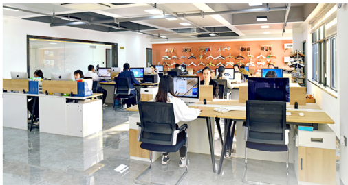
Well-trained sales and service team