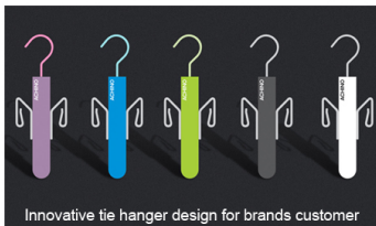
Innovative tie hanger design for brands customer