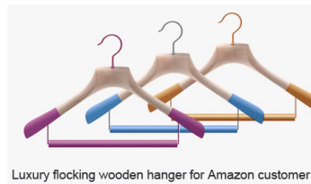
Luxury flocking wooden hanger for Amazon customer