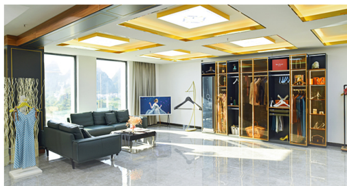
Good scene and easy talking space

In the past years, we rely on the trust and loyalty of our partners and customers who enable us become a stronger hanger company. We are glad to built this most advanced showroom to display the beauty of hangers.