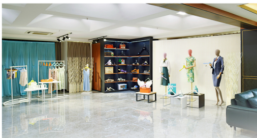
Luxury display and imitate store effects