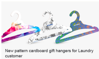
New pattern cardboard gift hangers for Laundry customer