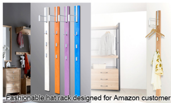
Fashionable hat rack designed for Amazon customer