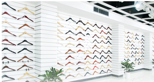
Excellent showroom for hangers